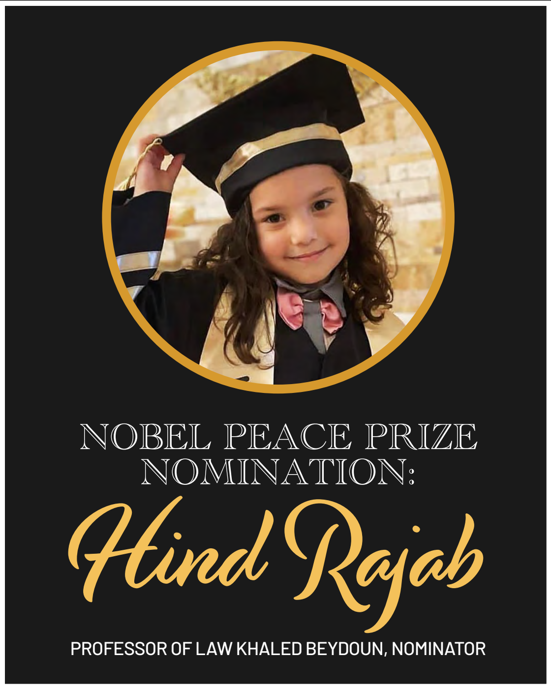
GRAPHIC EXAMPLE #2