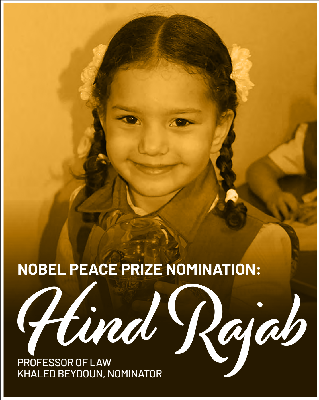
GRAPHIC EXAMPLE #3